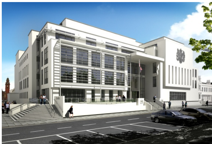
Warwickshire Justice Centre, Leamington Spa